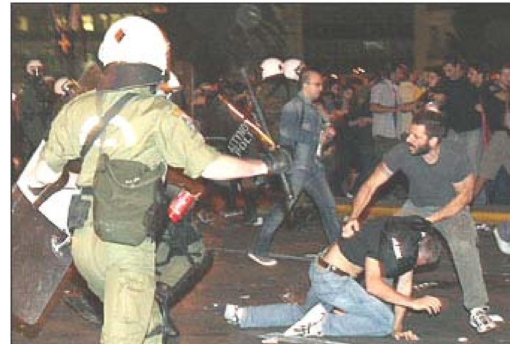
Demonstrators in Greece riot over new taxes and government spending cuts required to secure a bailout package to keep the nation from defaulting

Inflation is being pushed up by increases in commodity prices, and indirect taxes have resulted in a squeeze on real wages in developed countries