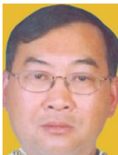
HRH Prince Samdech Norodom Sirivudh

he leads a project on arms control in Asia.