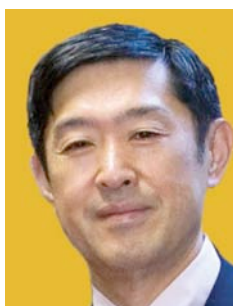
Prof. Dr. Shinichi Kitaoka