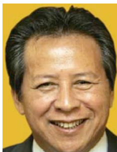
The Honourable Dato' Sri Anifah Hj. Aman (TBC) Minister of Foreign Affairs, Malaysia