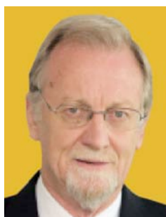
The Hon. Prof. Gareth Evans