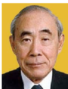
Amb. Koji Watanabe

Former Myanmar Ambassador to the United Nations, Myanmar