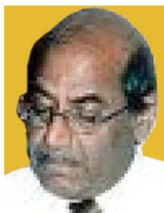
Amb. Shyam Saran Former Special Envoy on Climate Change & Foreign Secretary, India

Shyam Saran is a career diplomat. Since joining the Indian Foreign Service in 1970, he has served in several capitals of the world including Beijing, Tokyo and Geneva. He has been India's Ambassador to Myanmar, Indonesia and Nepal, and High Commissioner to Mauritius. In the Ministry of External Affairs, New Delhi, Shyam Saran headed the Economic Division and the Multilateral Economic Division. He also headed the East Asia Division which handles relations with China and Japan. As a Joint Secretary in the Prime Minister's Office in 1991/92, he advised the Prime Minister on foreign policy, and nuclear and defence related issues. After a career spanning 34 years in the Indian Foreign Service, Saran was appointed India's Foreign Secretary in 2004 and held that position till his retirement from service in September 2006. Subsequent to his retirement, he was appointed Prime Minister's Special Envoy for Indo-US civil nuclear issues and later as Special Envoy and Chief Negotiator on Climate Change. He has concluded his assignment in Government and has returned to being a private citizen. Saran holds a post-Graduate degree in Economics. He speaks Hindi, English and Chinese and is conversant in French.