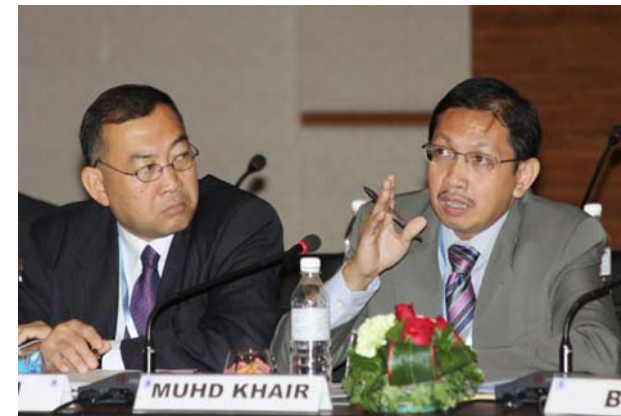
(From left) Samdech Norodom Sirivudh, Muhd Khair Razman

There is too little appreciation of the depth of the security relationship between ASEAN countries, Australia, and New Zealand. In everyday practical areas, Australia and New Zealand have been active in the region over a long period. 'The Five Power Defence Arrangements' (involving Malaysia, Singapore, Australia, New Zealand and Britain) is seen as highly valuable, but largely for