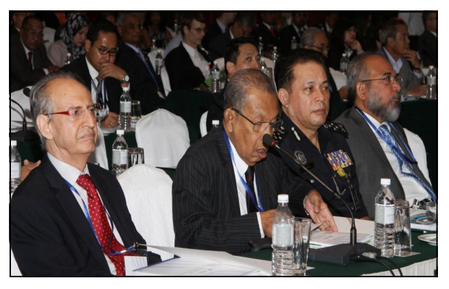
Participants at the Keynote Address

Malaysia remains, now and forever, a harmonious and peaceful nation. 1Malaysia is not about winning the election, 1Malaysia is about nationbuilding.