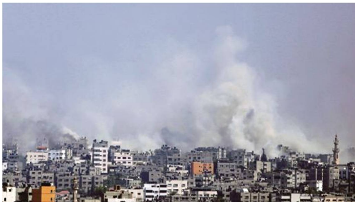
Smoke rises after an Israeli shelling at the Shijaiyah neighbourhood in Gaza City on Monday. Palestinian civilians are bearing the brunt of Israel's airstrikes.

No other people have had their land taken away and given to another to whom they did absolutely no wrong. Five million Palestinians and their descendants today live as refugees in neighbouring lands and as displaced persons in Gaza and the West Bank, often in communities separated from one another and from the land they till.